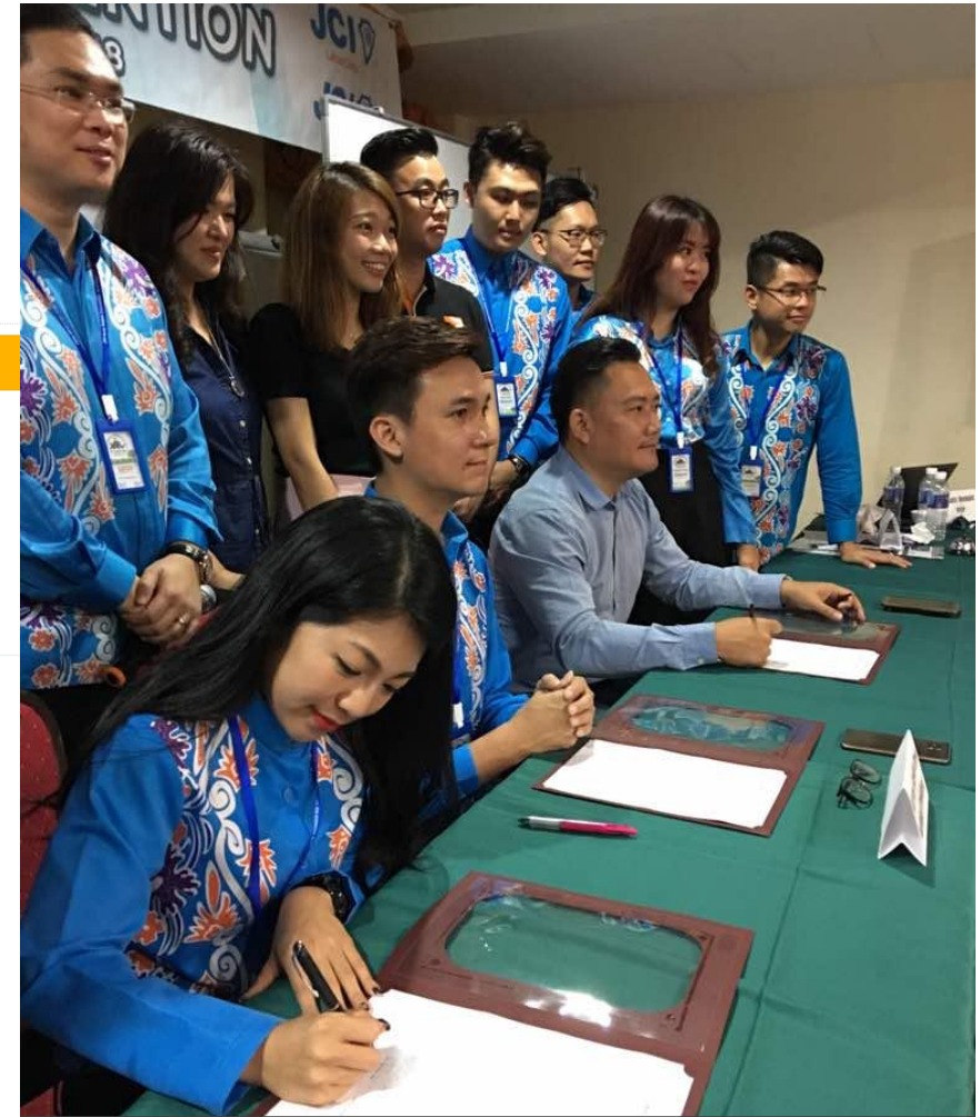
Signing of MOU between OnePay Solution Sdn Bhd, JCI Malaysia & JCI Tanjung Aru during JCIM Area Sabah Convention